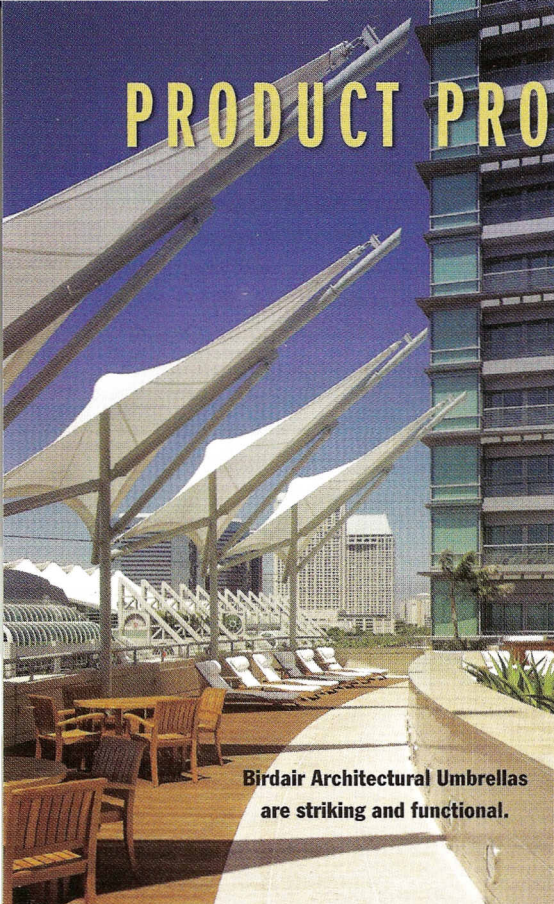
Birdair Architectural Umbrellas are striking and functional.